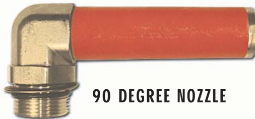
90 DEGREE NOZZLE