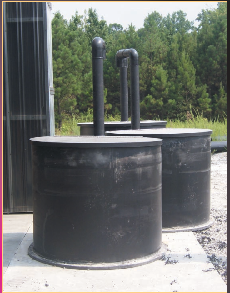
Methane Gas Well Covers