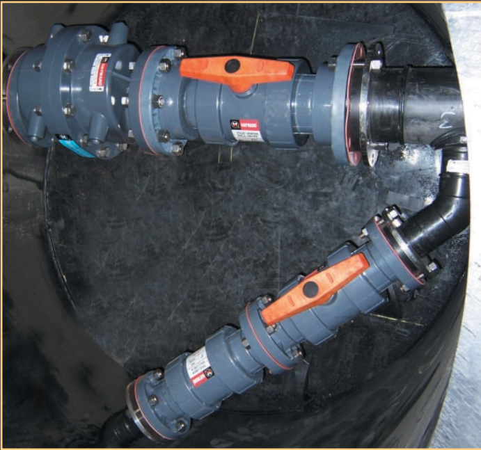
Valve Vault with Dual Containment Piping