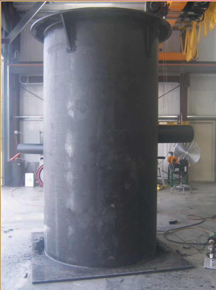
Raw Sewage Wetwell